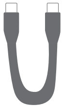
USB-C PD cable