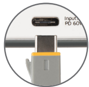
USB-C PD IN/OUTPUT

EXAMPLE: CX024 - XTORM AC ADAPTER USB-C POWER DELIVERY (60W)